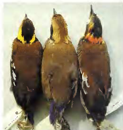
Plate 5. Banded Pitta females (dorsal view): left to right, P. g. schwaneri, P. g. guajana and P. g. irena.